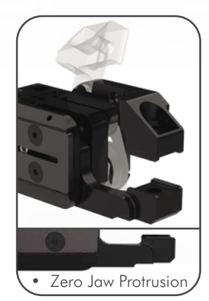
84N5-X-075-DA Double Open Jaw