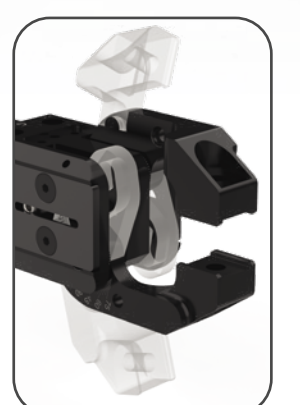
84N5-X-075-PA 90° Jaw Configuration