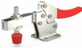
245-U Flanged Base U-Bar